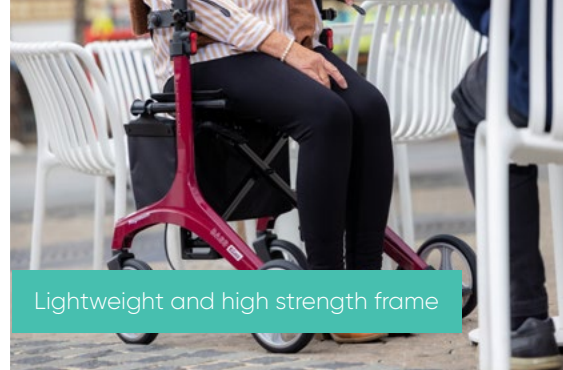
Lightweight and high strength frame