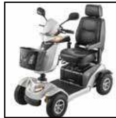
Modern LED lighting system