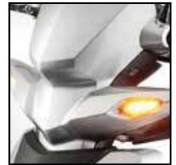
Modern LED lighting system