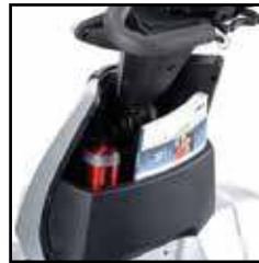
More space for storage