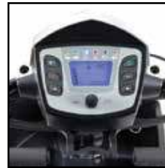
Digital LCD dashboard display