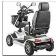
Modern LED lighting system