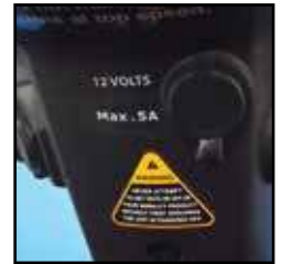
Handy 12 volt socket

Overall Dimension : A x B x C 130 x 69 x 125cm/51 x 27 x 49"