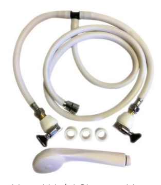
Hand Held Shower Hose