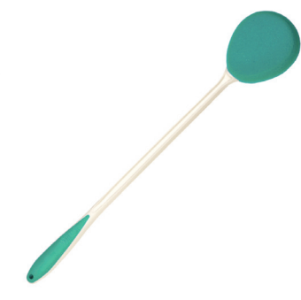
Long Handled Sponge