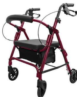
Rollator & Walker