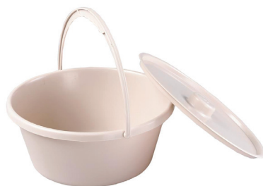
Bowl with Lid