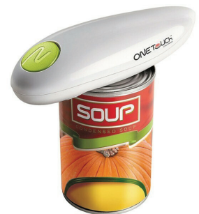
OneTouch Can Opener