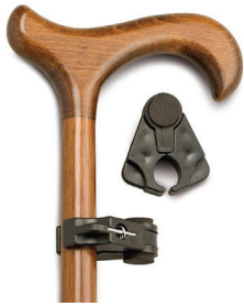
Walking Stick Holder