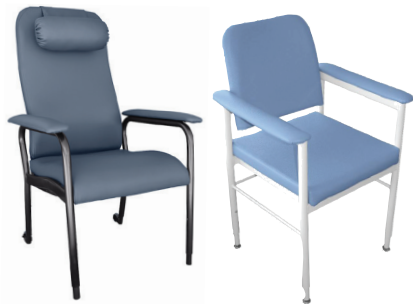
High/Low Back Chair